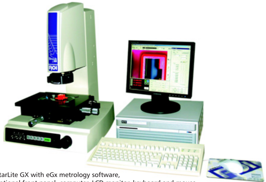
StarLite GX with eGx metrology software, optional front panel, computer, LCD monitor, keyboard and mouse.